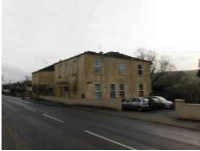
Ebley Road, Cotswold stone