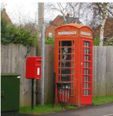
Downton Road phone box and post box