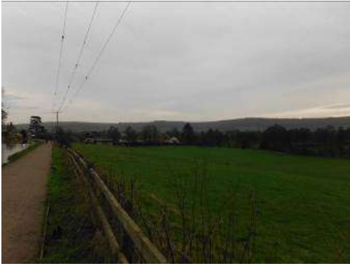
Field looking towards Selsley from Ocean Bridge