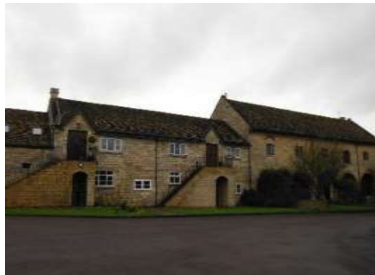
Court Farm House