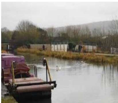
Canal with Stroudwater Canal Trust boats