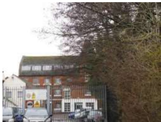
Main building at Upper Mills, Downton Road