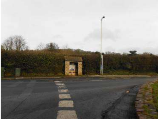
Bus Stop on Ebley Road and view of Doverow Hill

(viii) Views of Doverow Hill and Haresfield Hill to North