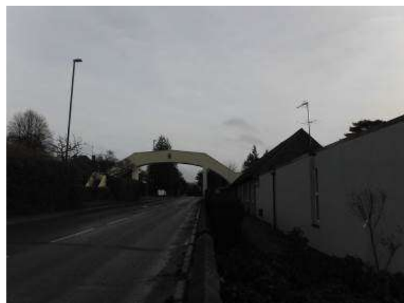
Wycliffe College Bridge, Ebley Road