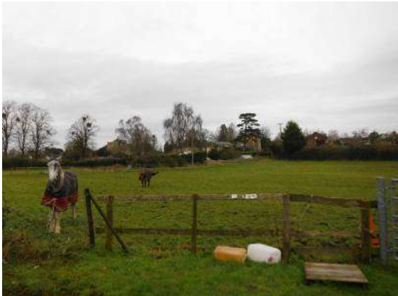
Nutshell field opposite Paper Bag Mill