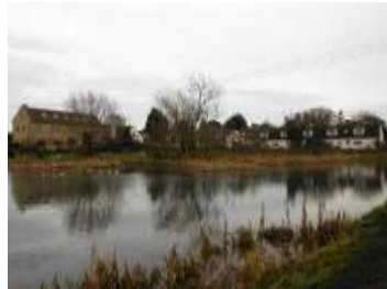
Court Farm Mews from canal side by Ocean