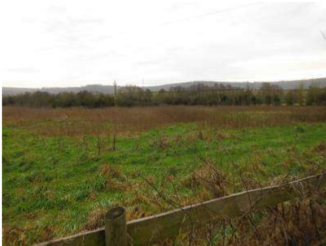
Field off Downton Road looking towards Ryeford with Selsley Hills