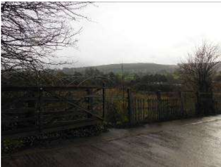
Ebley Road: View over field to the West of Stanley Hills