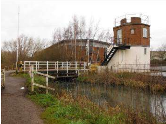
Gatehouse, Bonds Mill