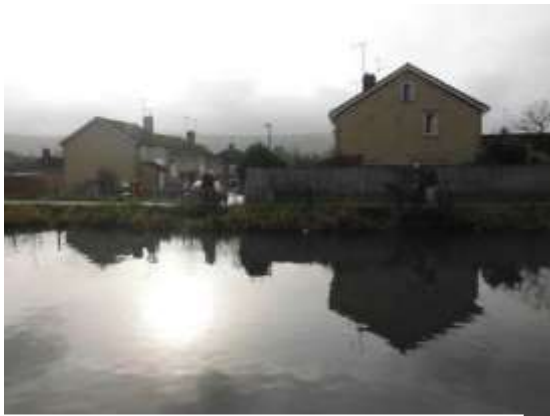
Bridgend taken from Boakes Drive by railings