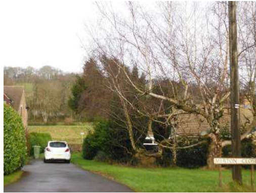
View from South side of Ebley Road towards Doverow Hill