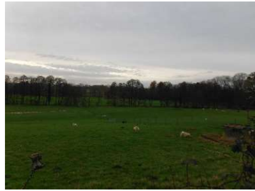
Field opposite Stonehouse Court south of canal taken from canal tow path