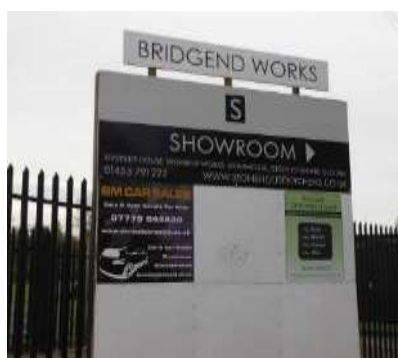
Bridgend Works from Downton Road