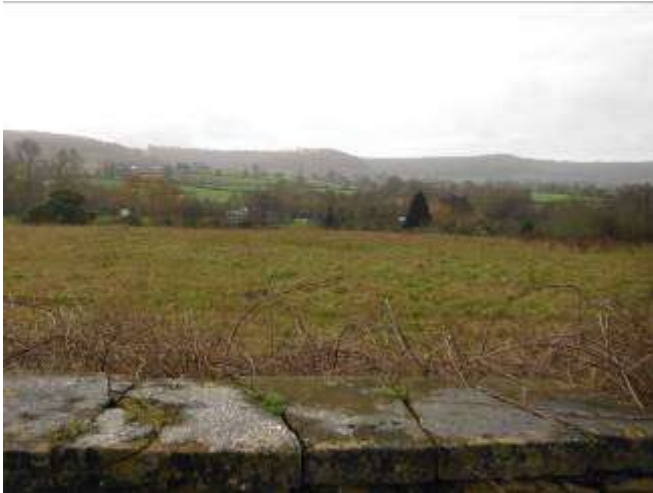
Ebley Rd: Field jointly owned by residents of Ebley Rd