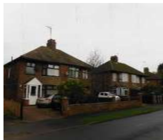
Haven Avenue, red brick houses