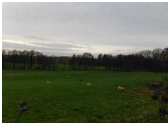
Field opposite Stonehouse Court south of canal taken from canal tow path