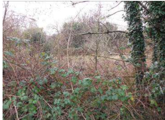
Wycliffe Land South West of Horsetrough Roundabout, taken from pavement