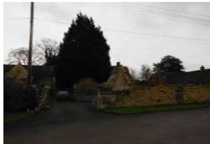
Court Farm, Cotswold stone converted farm