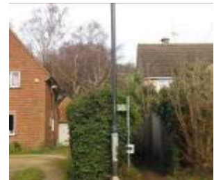
Cotswold Way leading up past vineyards