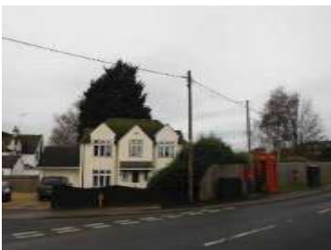
House at Haven Avenue, old phone box