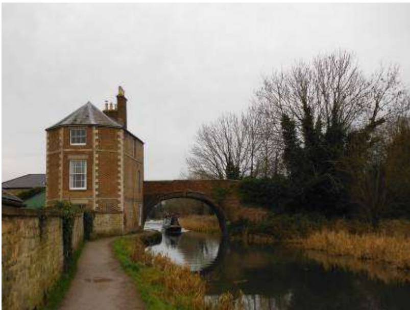
Nutshell House and integral Bridge with Stroudwater canal boat "Perseverance"