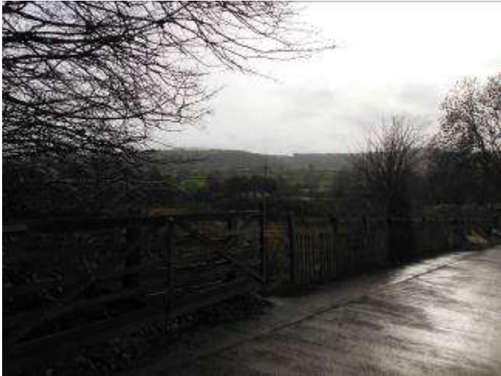
Ebley Road: View over field to the East of Selsey Common