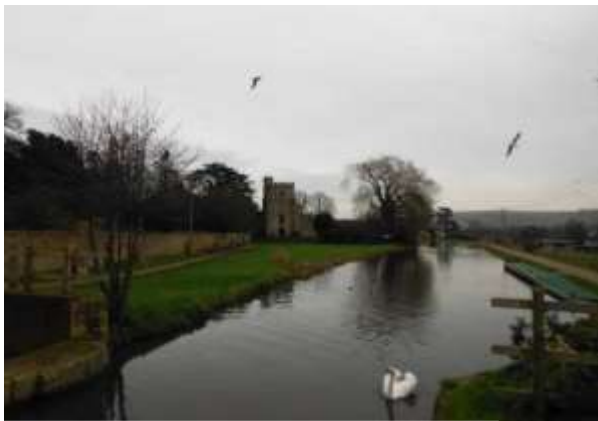
St Cyr's Church from the Ocean