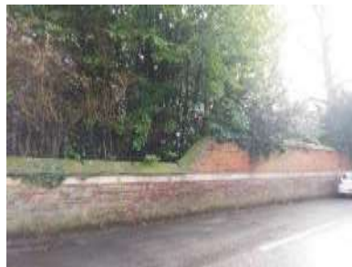
Ryeford Road North stone white line continues in wall from houses below.