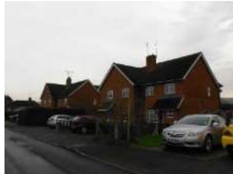
Wharfedale Road, Bridgend