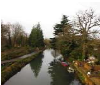
Canal taken from bridge on Ryeford Rd North (Cotswold Way)