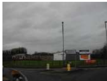
Stonehouse Business Park allocated industrial land, photo taken from pavement on roundabout