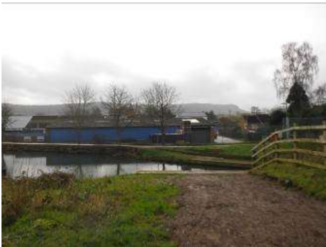
Upper Mills Industrial Estate