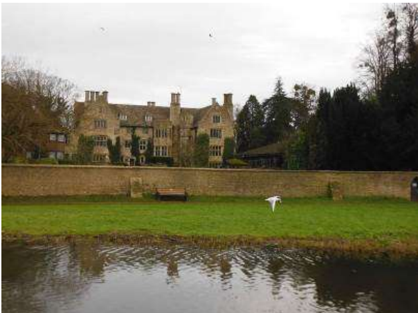
Stonehouse Court from South side of canal