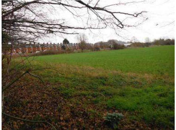
Land opposite Avenue Terrace taken from Bonds Mill car park