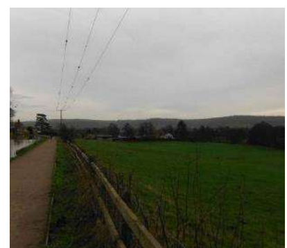
Field looking towards Selsley from Ocean Bridge