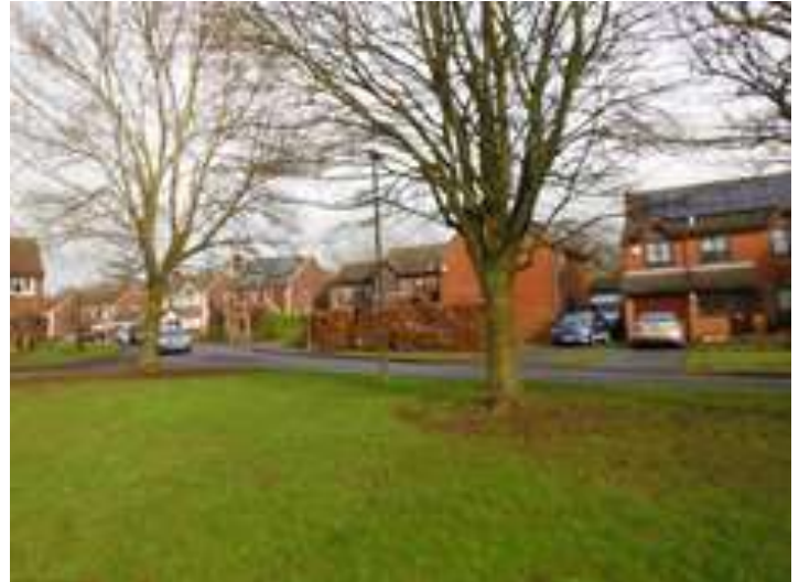
Houses at Boakes Drive showing style of light and dark brick based on Nutshell House and traditional local buildings