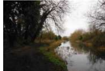
Canal looking west towards Bonds Mill from canal path by railway bridge