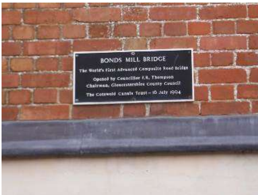
Bonds Mill Bridge