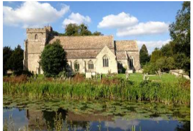
Church of St Cyr from canal towpath