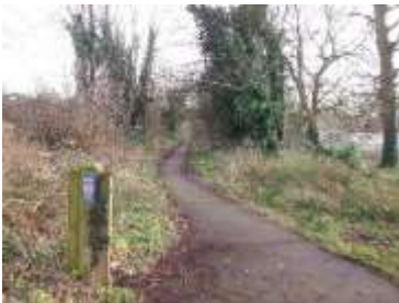
Cycle Track National Route 45 leading to Swindon from Saul