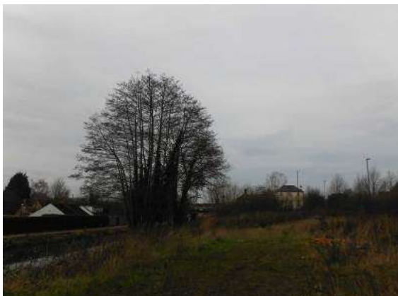
Ship Inn Site view towards Downton taken at edge of Upper Mill bridge