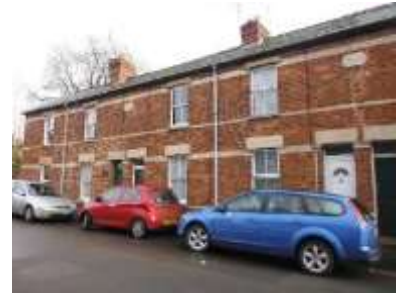
Ryeford Road North houses with limestone detail in brickwork