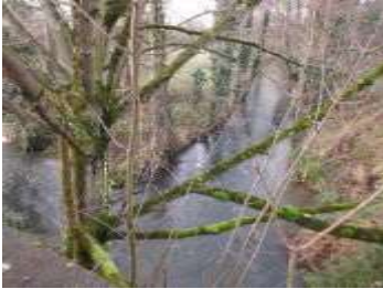
River Frome divides here where it has overflowed many times