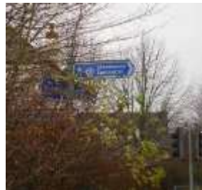
Cycle track showing route to Stonehouse Town and towards Eastington