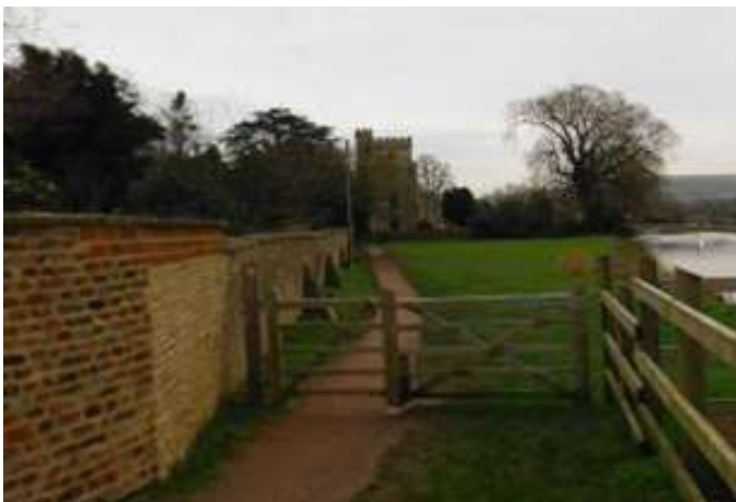
Path to St Cyr's from Ocean Bridge showing Stonehouse Court Wall and buttresses