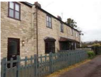
Nutshell Path, Cotswold stone cottages