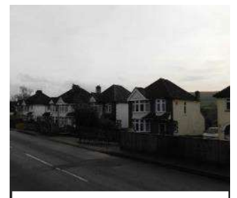
Ebley Road, mixed brick and render