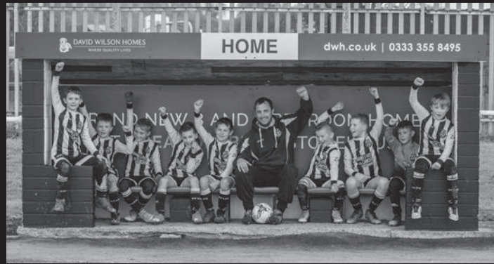
The u10 team in the main dugouts that have had signage donated by David Wilson homes

Stonehouse Town Football Club is looking for players, coaches and helpers of all ages to come along and enjoy football with the enthusiastic friendly teams. There are positions for coaching/ assisting all age ranges from under 7 to adult teams.