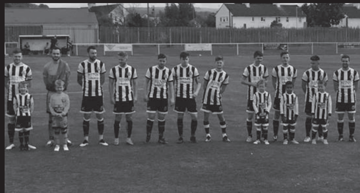
Youth team mascots, which has been done several times through the season, is a great inspiration for the young players to be involved with the adult teams.

There is a charity match being held at Oldends Lane ground on Saturday 18th May playing for the inaugural match of the Michael Carmen Memorial Cup, KO 2pm.