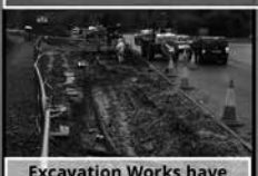
Excavation Works have been completed at exit