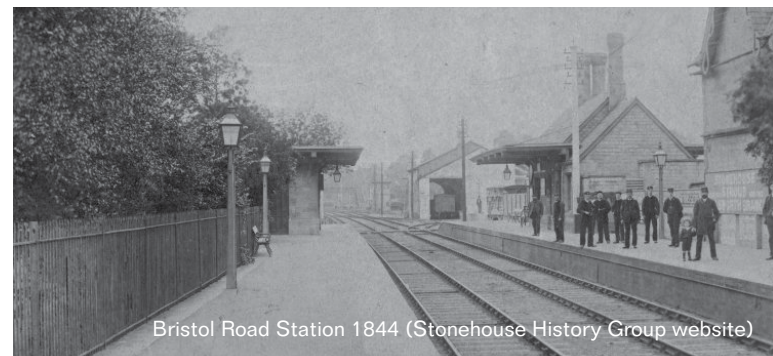
Bristol Road Station 1844

Railfuture is a pressure group campaigning for the Bristol Road Station to be reopened railfuture.org.uk/our+cause