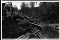
Excavation works have been completed