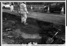
Western Power Distribution diverting electric