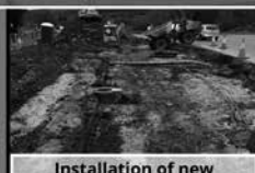
Installation of new drainage gullies