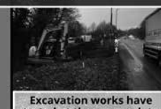
Excavation works have started at the approach to Horsetrough roundabout