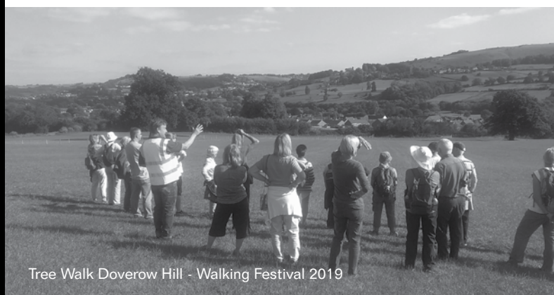
Tree Walk Doverow Hill - Walking Festival 2019