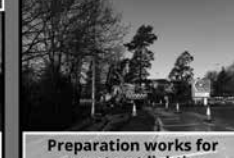
Preparation works for new street lighting