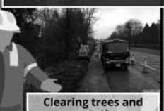
Clearing trees and vegetation