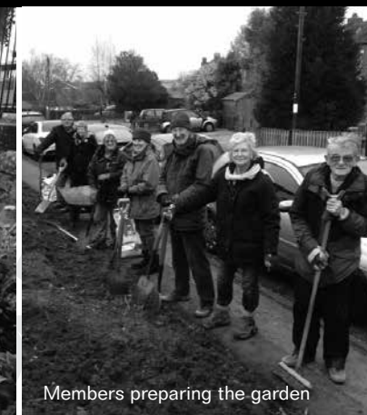
Members preparing the garden