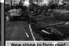
New stone to form road base layer