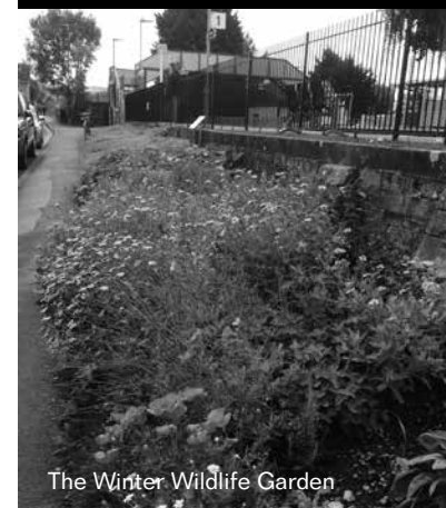
The Winter Wildlife Garden