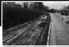
Western Power Distribution cables for diversion